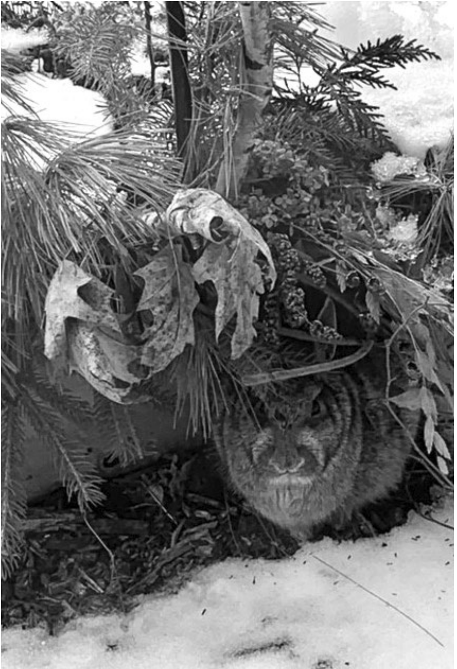
"UNDERCOVER RABBIT"

Visit our website to purchase a gift certificate for any occasion in any amount. Gift certificate holders must contact the OLLI at Iowa State office to redeem them.