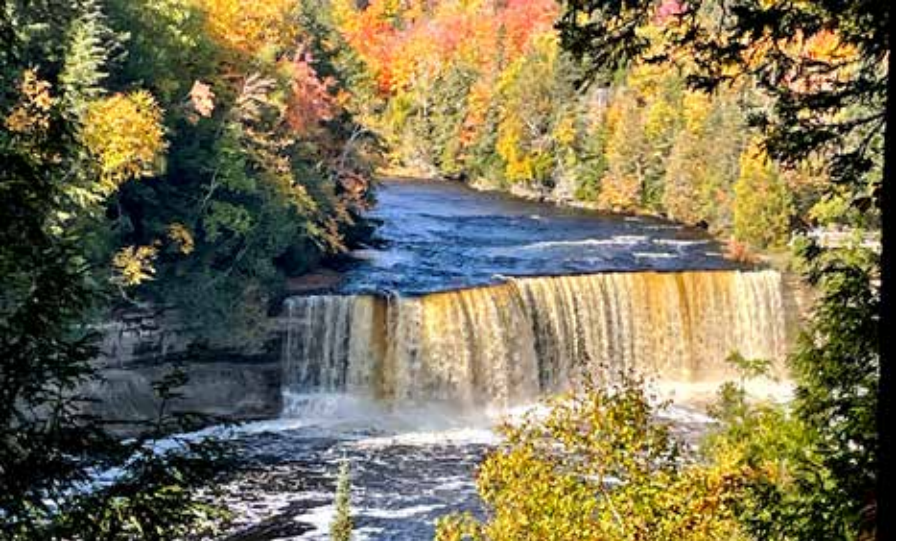
Waterfall , Judy Levings